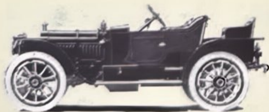
1911 Packard 30 Runabout

We will always try to match or beat any written quotes.