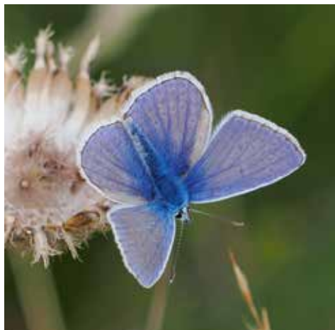
Left: Common Blue, Chiltern Gentian, Cattle welcoming visitors at Dancersend Extension. Below: Small Copper, Volunteers clearing scrub from chalk grassland, Hebridean sheep. All at Dancersend – Mick Jones.