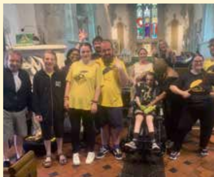
Electric Umbrella at St Michael's Church

In August, it was a 'St Michael's Got Talent' show when The Electric Umbrella, Simon Cowell's Golden Buzzer from the popular TV show, Britain's Got Talent 2025, came to perform especially for our Little Angels Toddler and Babies group and for the wider community.