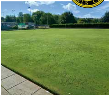
Worm casts on the green at the end of August

As the chestnuts start to fall from the beautiful trees beside our green, the bowls club approaches the end of a very successful season, welcoming many new members. There have been wins and losses in the various matches played against other local clubs, but above all, everybody has enjoyed their bowls, which is by far the most important thing.