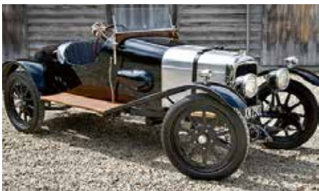
Photos: (left) 1910 MAF, The Start of the Aston Hill climb, 8 June 1912, 1923 Aston Martin Cloverleaf, (above) 1914 BSA and 1921 Aston Martin A3.

Chilterns Neuro Centre, an organisation that supports people affected by multiple sclerosis, Parkinson's and stroke, and Kirby's Herd, a local group that raises funds for Cancer Research UK.