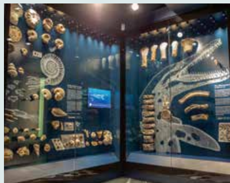
Local fossils in the newly redisplayed Geology gallery.'

Only a short walk from Market Square in the historic part of Aylesbury around St Mary's Church. With changing exhibitions, permanent displays about Bucks and the fabulous Roald Dahl Children's Gallery, there's something for visitors of all ages to enjoy.