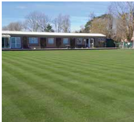
The clubhouse and green in early March.

Nestled in the park next to the tennis courts in the heart of the village, the Bowls Club is more than just a place for sport, it's a hub of friendship and community spirit too. Established in 1948, the club has grown into a welcoming space for players of all ages and skill levels. Whether you're a seasoned bowler or a curious beginner who might like to play bowls, there's a warm welcome for you here, at your local bowls club. We are having a registration evening for both new (and existing) members on Wednesday, April 9 in the clubhouse from 7.00pm, and we would love to see you.