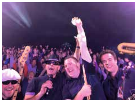
Skamungas, Astonbury 2018

We have a great summer ahead, starting off with Play in the Park on Monday July 29th from 2-4pm . Children from four years are welcome to come and join the activities for free, with craft in the Churchill Hall (courtesy of the local childminders), large inflatables and rides in the park for the more adventurous ones.