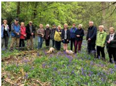
U3A walking group visiting a bluebell wood at Ashridge Estate.

Please mention Village Life when responding to our advertisers.