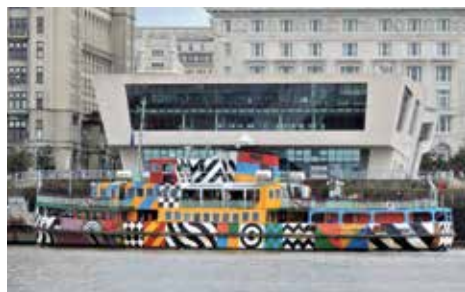
The Mersey Ferry

The Albert Docks area in Liverpool is a superb example of modernisation, complete with statues, a Tate Modern and Museums of Liverpool, slavery and the Beatles. The café culture abounds and reflects the history, the Beatles and the University as well as tourism. We saw the cathedrals: the Catholic with its wigwam shape and outstanding glass and sculpture work, and The Anglican with its great community spirit. The Bombed Out Church with the statue of the two soldiers – British and German with their football – also used as a concert venue, was very moving. There was also, of course, The Cavern where the Beatles used to play. The ferry taking passengers around the river was a work of art in itself – vibrant in its attitude of Liverpool as a modern city.