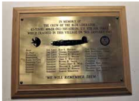
Commemorative plaque, St Michael and All Angels.

As the second world war entered 1945 the Allies were looking forward to victory, although there was still a long way to go.