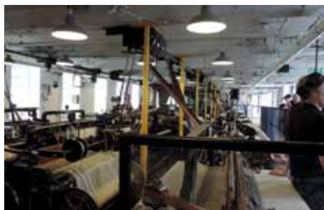
Quarry Bank Mill

We went through locks and swing bridges, one of which refused to open until an engineer was called. We sailed on through mudflat areas teeming with 20 species of birds. We went under the elegant cable-stayed bridge, lift bridges and through the amazing Barton Swing Aqueduct Bridge where another canal was cut apart as it crossed the Ship Canal. In Manchester we docked close to The Lowry Art Centre and the other attractions of the Salford Quays.