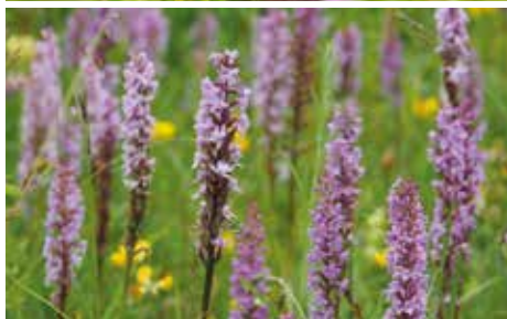
Top: Chiltern gentian at Dancersend.