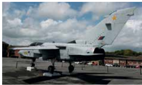
Tornado aircraft at Halton.

2019 was the centenary of RAF Halton, but it won't be celebrating many more anniversaries. The announcement in November 2016 gave the proposed closure date as 2022, but in February 2019 it was announced that the station would not close until at least 2025. This 'phased withdrawal' will represent the end of over a century of involvement in the local area.