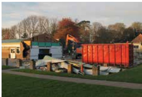
Demolition starts on the old building.

Our exciting new Community Centre project is now well underway, with the recent establishment of the temporary accommodation to house the Café in the Park and the Football Club.